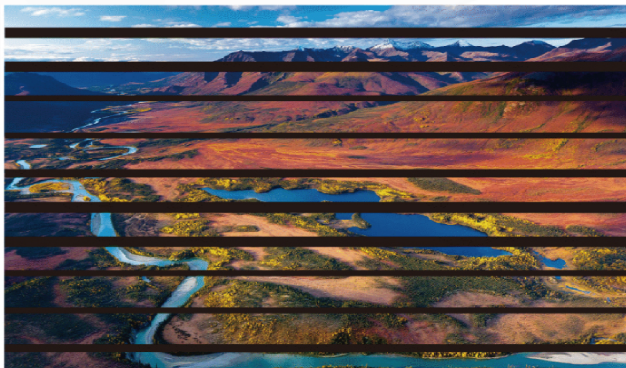
Low Refresh Rate