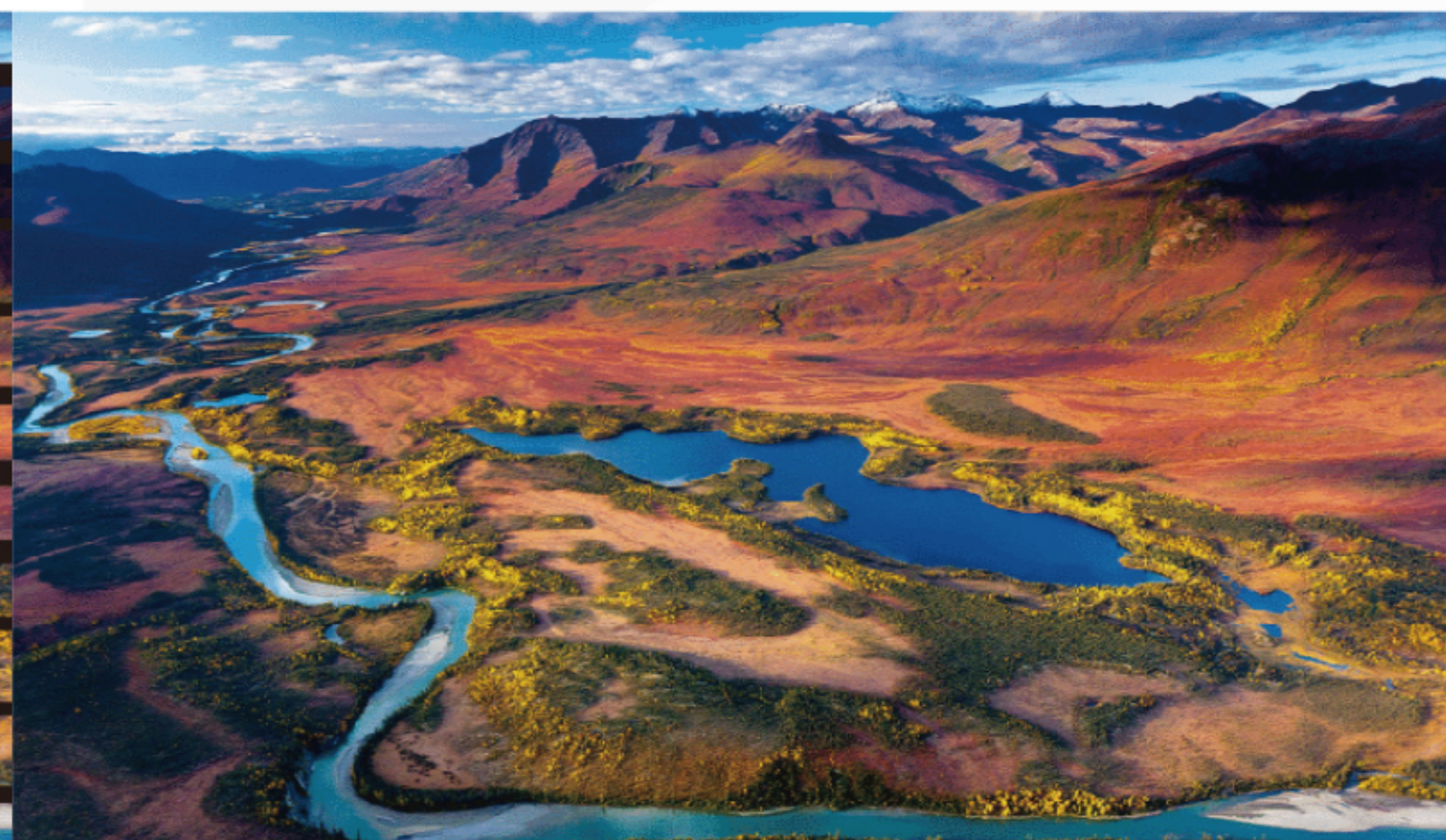
High Refresh Rate